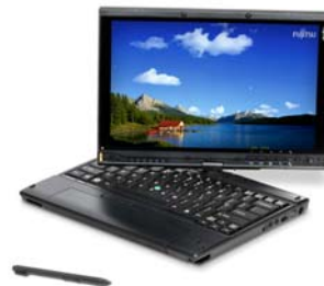
Tablet PC Convertible Tablet PC